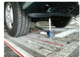
On the rack