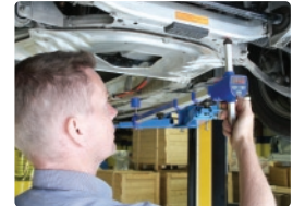
On the lift For fast & accurate damage analyse