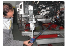
On the bench